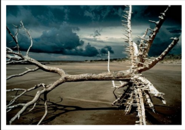
Northern Territory, Australia